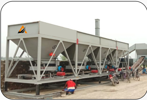
Asphalt Drum Mix Plant