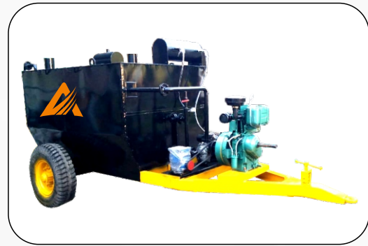
Tractor Mounted Sprayer