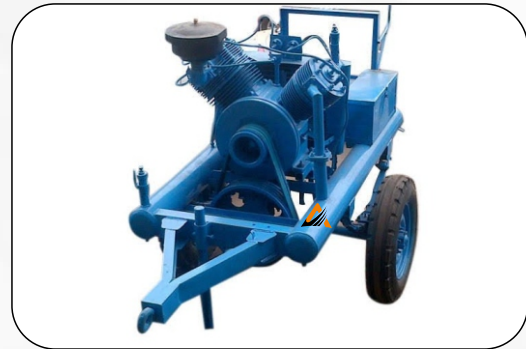
Tractor M.Air Compressor