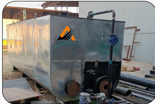
Bitumen Storage Tank