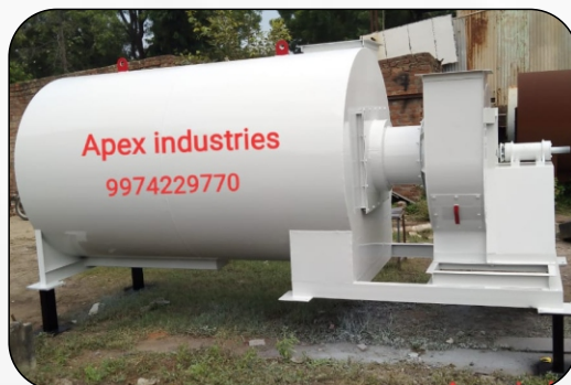
Pollution Control Unit