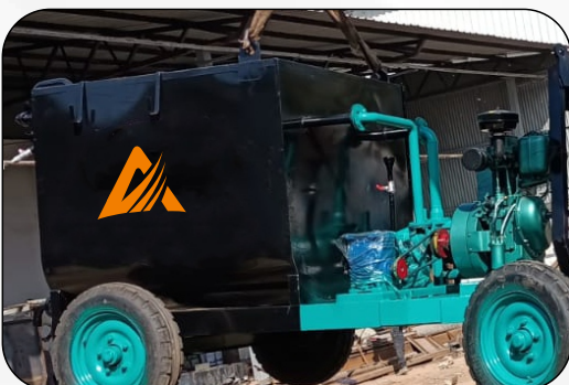
Tractor Mounted Sprayer