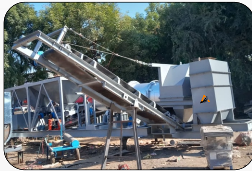
Mobile Drum Mix Plant